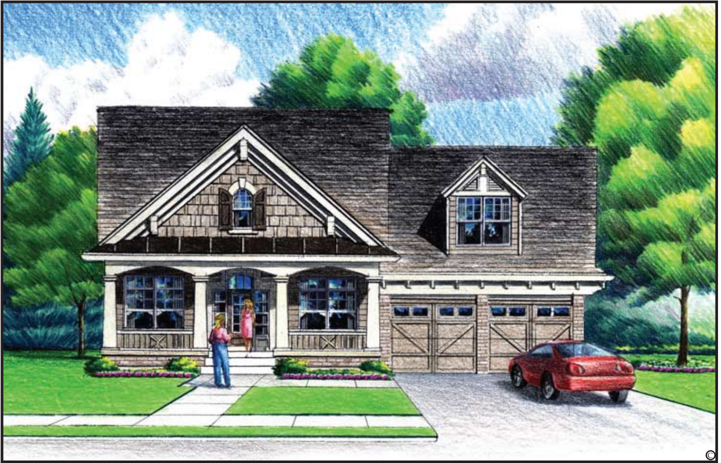
The front of the home may be reversed from this picture and also shows UPGRADED stone on exterior. Brick is standard on exterior.