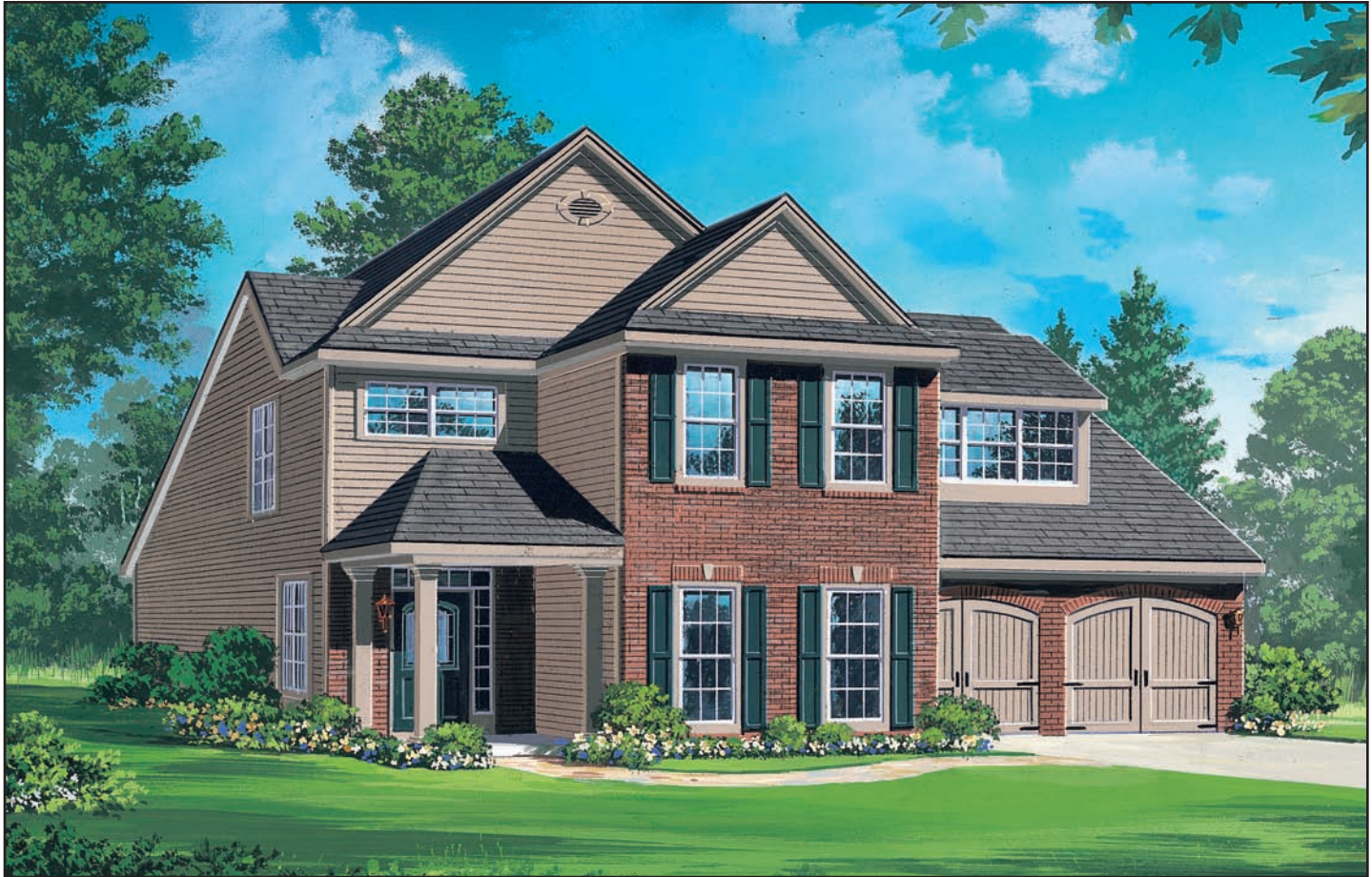
The front of the home may be reversed from this picture.

The Hayes offers all the benefits of our newest design. From the spacious two-story foyer you can enter the dining/living room, while the family room is located in the back of the home offering a quiet retreat. The family room opens to the morning room and kitchen. You'll also find a wonderful master suite with walk-in closet and garden tub. This design offers total flexibility, you have an optional large fourth bedroom or standard loft. The Hayes is a great home for families of all sizes.