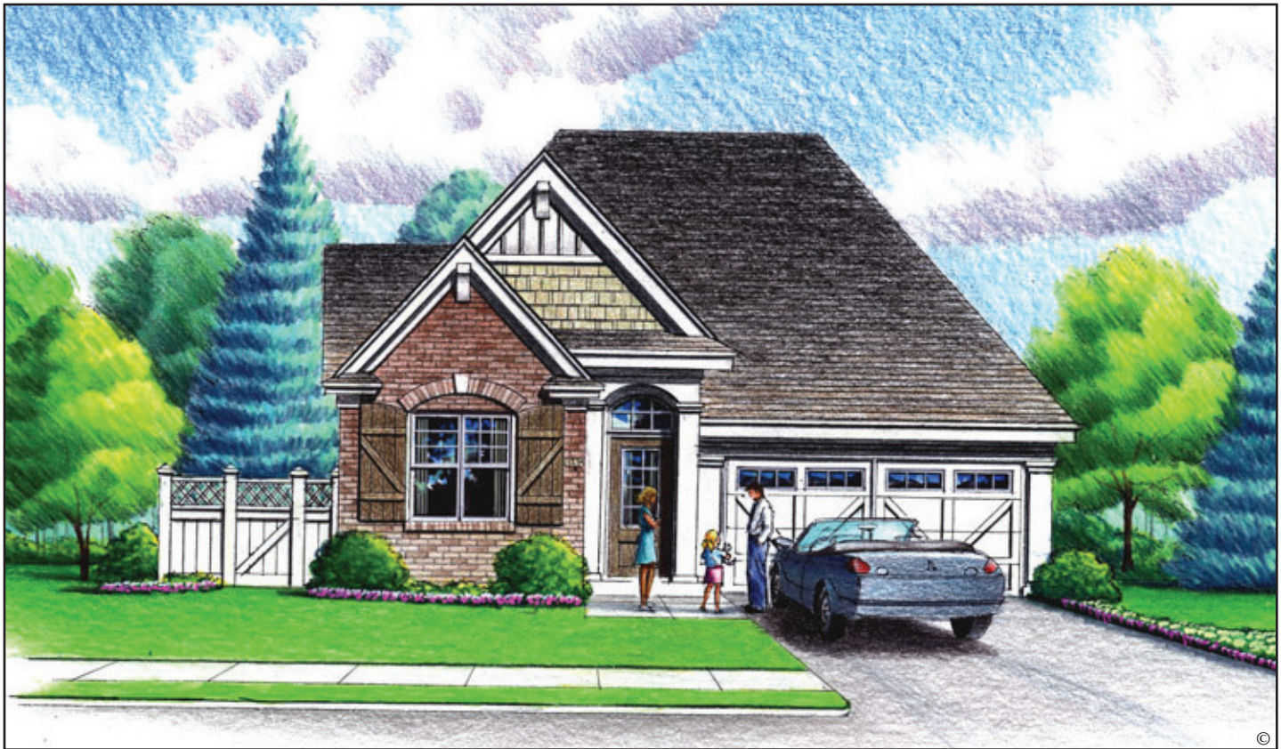
The front of the home may be reversed from this picture.

Walking up to this home you will be instantly impressed. This beautiful and unique brick front home has the character that you have been craving. Inside this home you will note the spaciousness that you and your family deserve from the oversized Kitchen that accommodates a Kitchen island to the split Bedroom design which allows for maximum privacy. This three Bedroom, two full Bath plan reflects a comfortable, spacious design...ideal for today's more casual lifestyles.